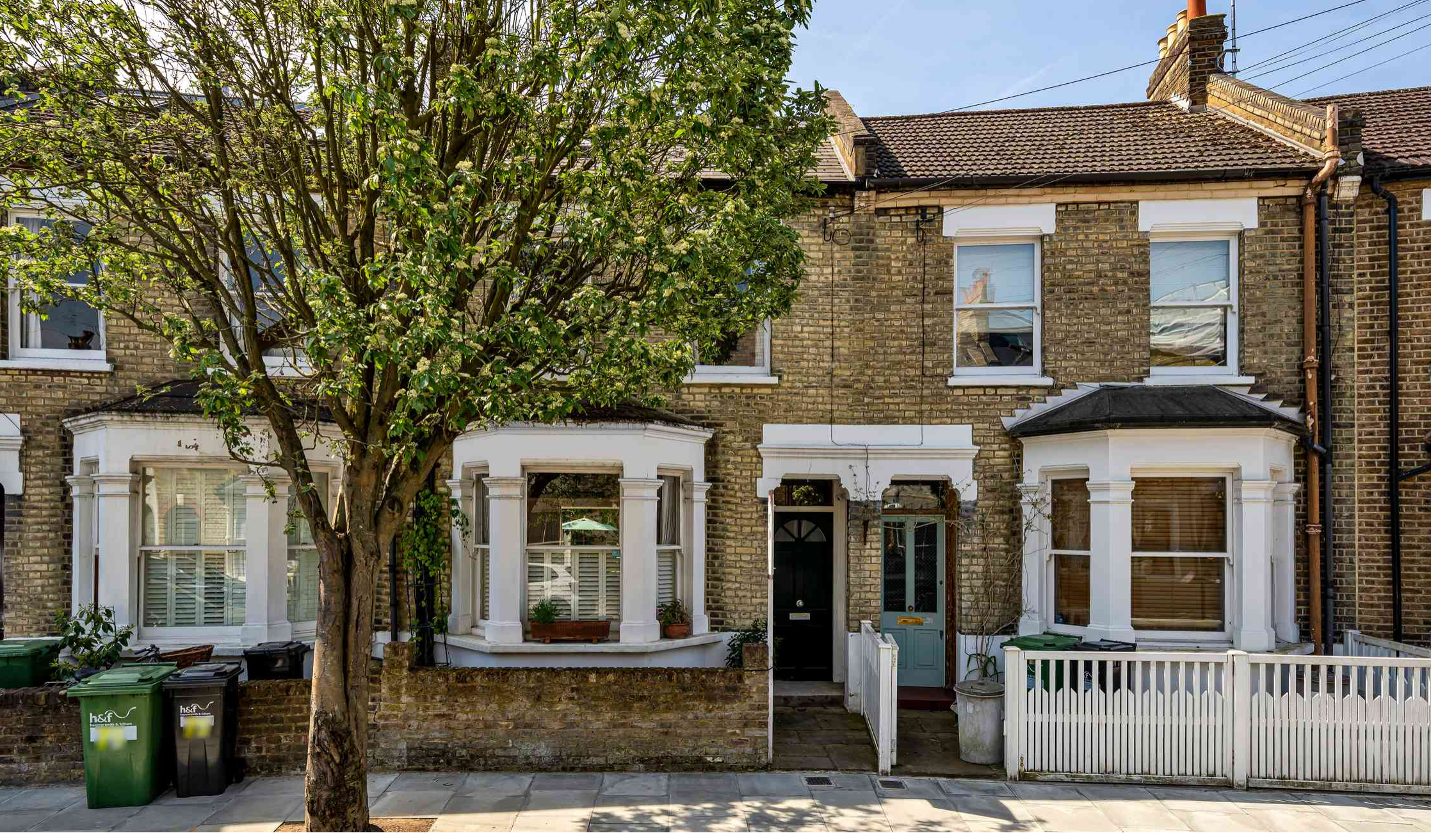
Gayford Road, London, W12 9BY