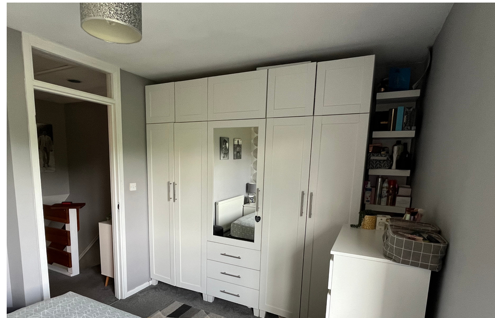
53 Deerhurst Close, Feltham, Greater London. TW13 7HS £399,950 - Freehold