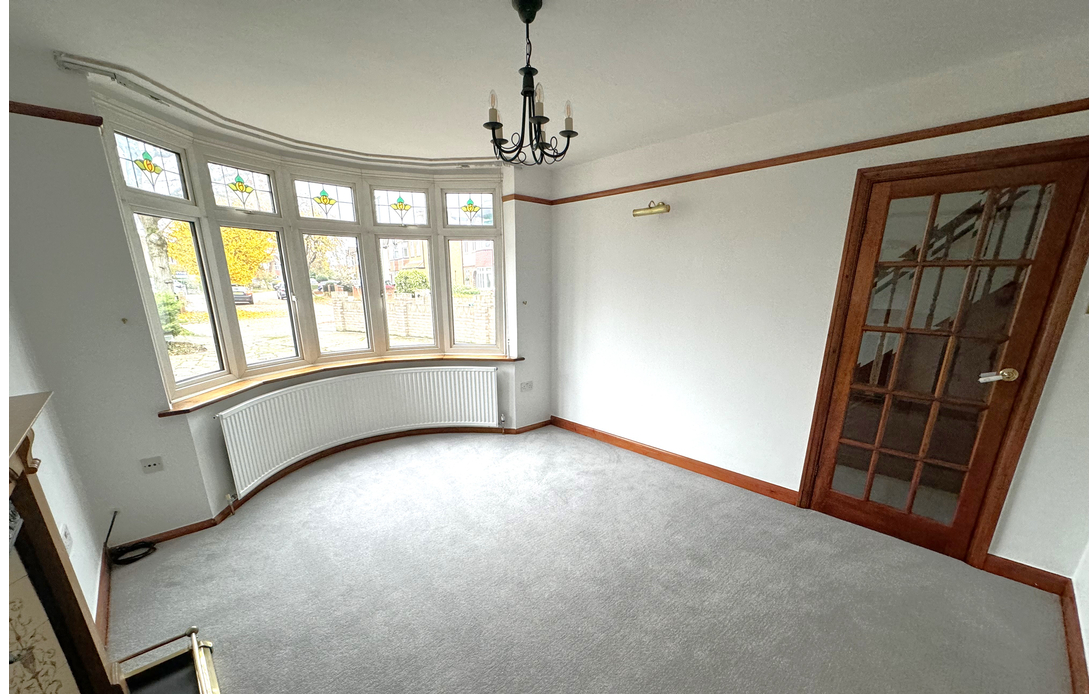
37 Ashview Gardens, Ashford TW15 3RE £684,950 - Freehold