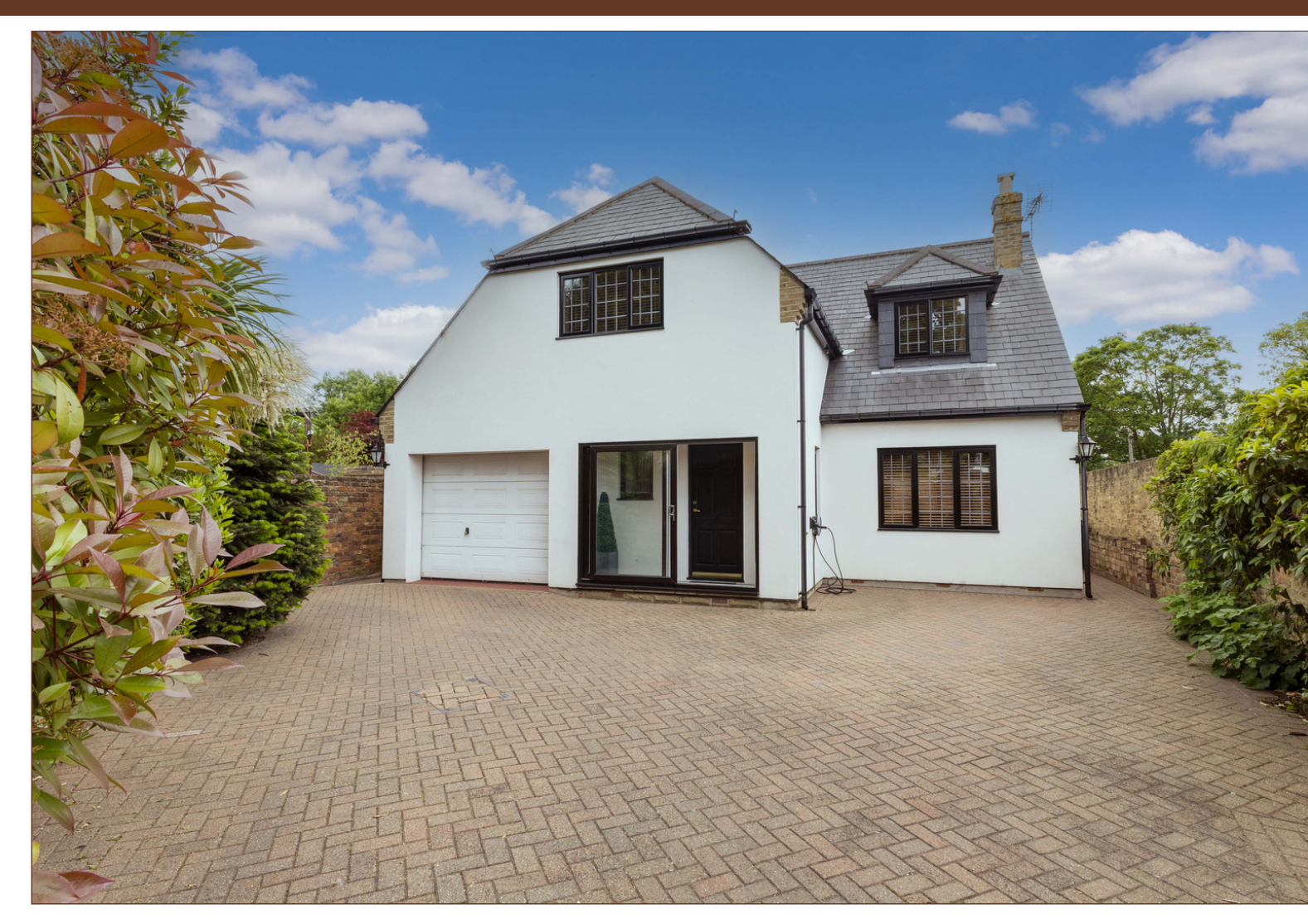
Oakwood Estates are proud to present this beautifully maintained and deceptively spacious three-bedroom, two-bathroom detached home, enviably located in the heart of Iver Village.

Set behind a substantial and private brick wall, this attractive residence offers a rare blend of privacy, convenience, and family-friendly living. Ideally situated just a stone's throw from local shops, amenities, and a little over a mile from Iver Station (Elizabeth Line), the property provides excellent connectivity for commuters heading into Central London or Heathrow.