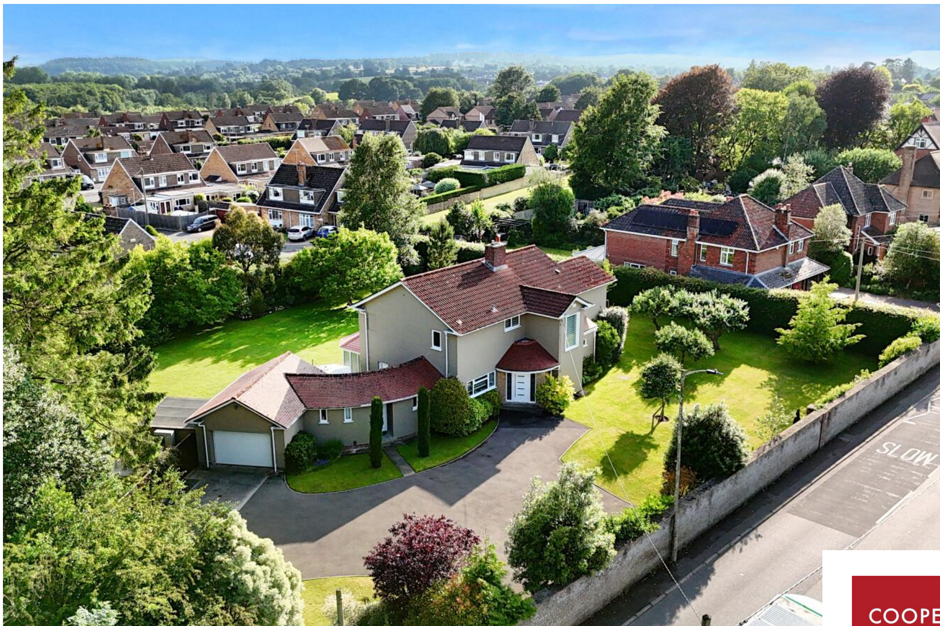
Wylde Lodge, 84 Boreham Road, Warminster, Wiltshire, BA12 9JW