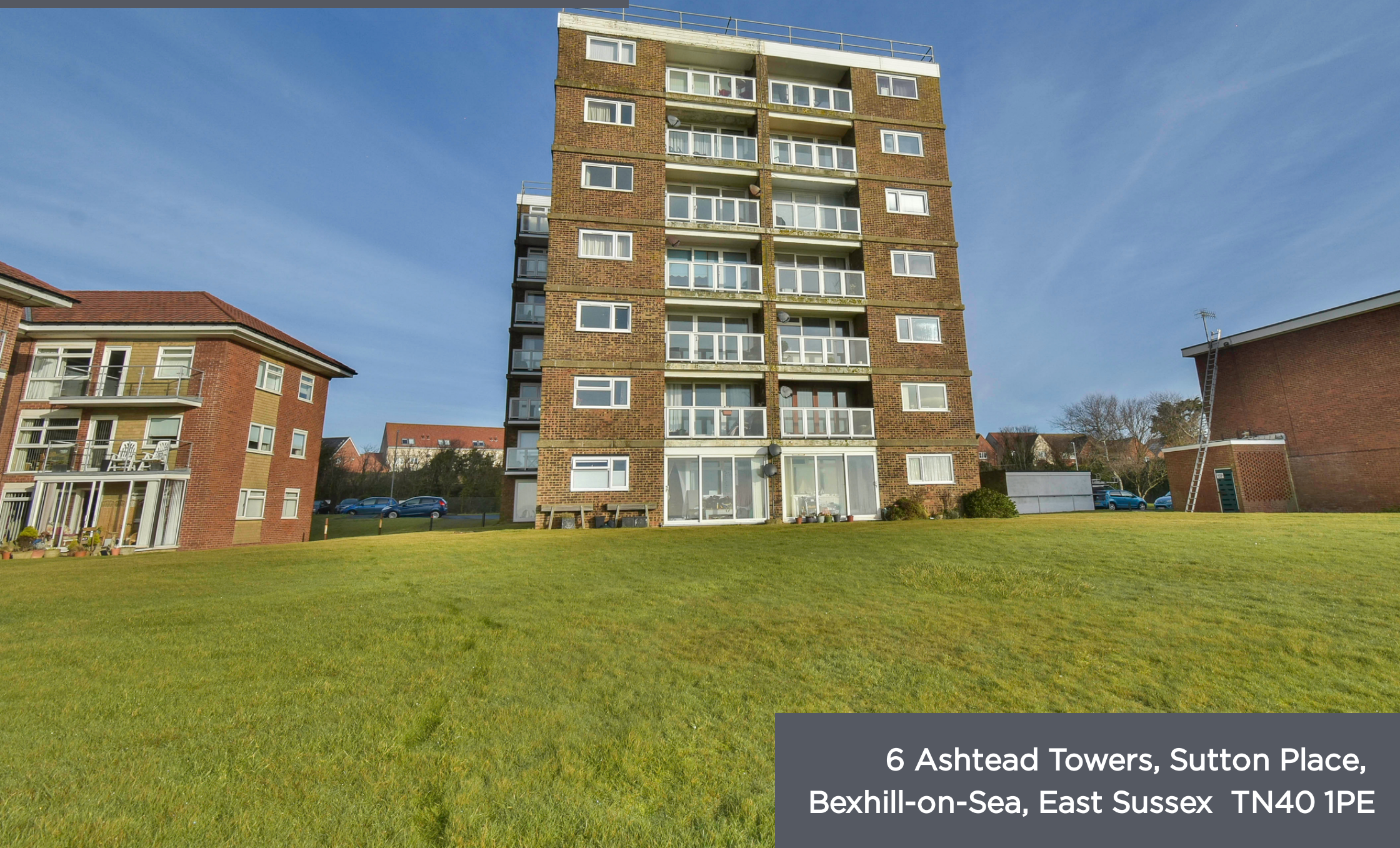
6 Ashted Towers, Sutton Place, Bexhill-on-Sea, East Sussex TN40 1PE