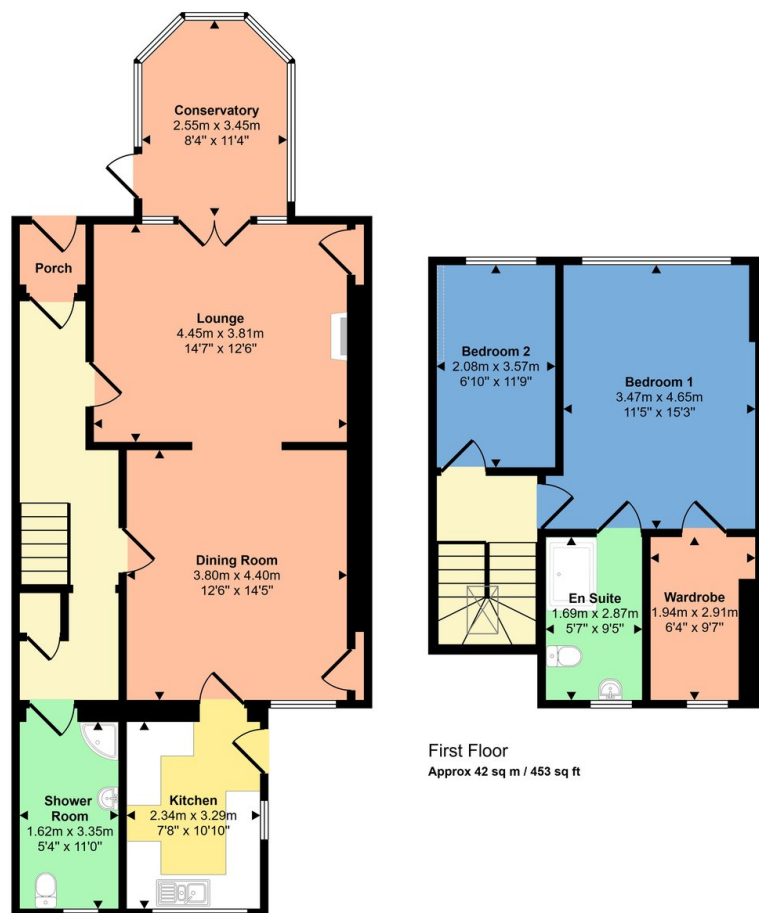
First Floor Approx 42 sq m / 453 sq ft

Approx Gross Internal Area 116 sq m / 1247 sq ft