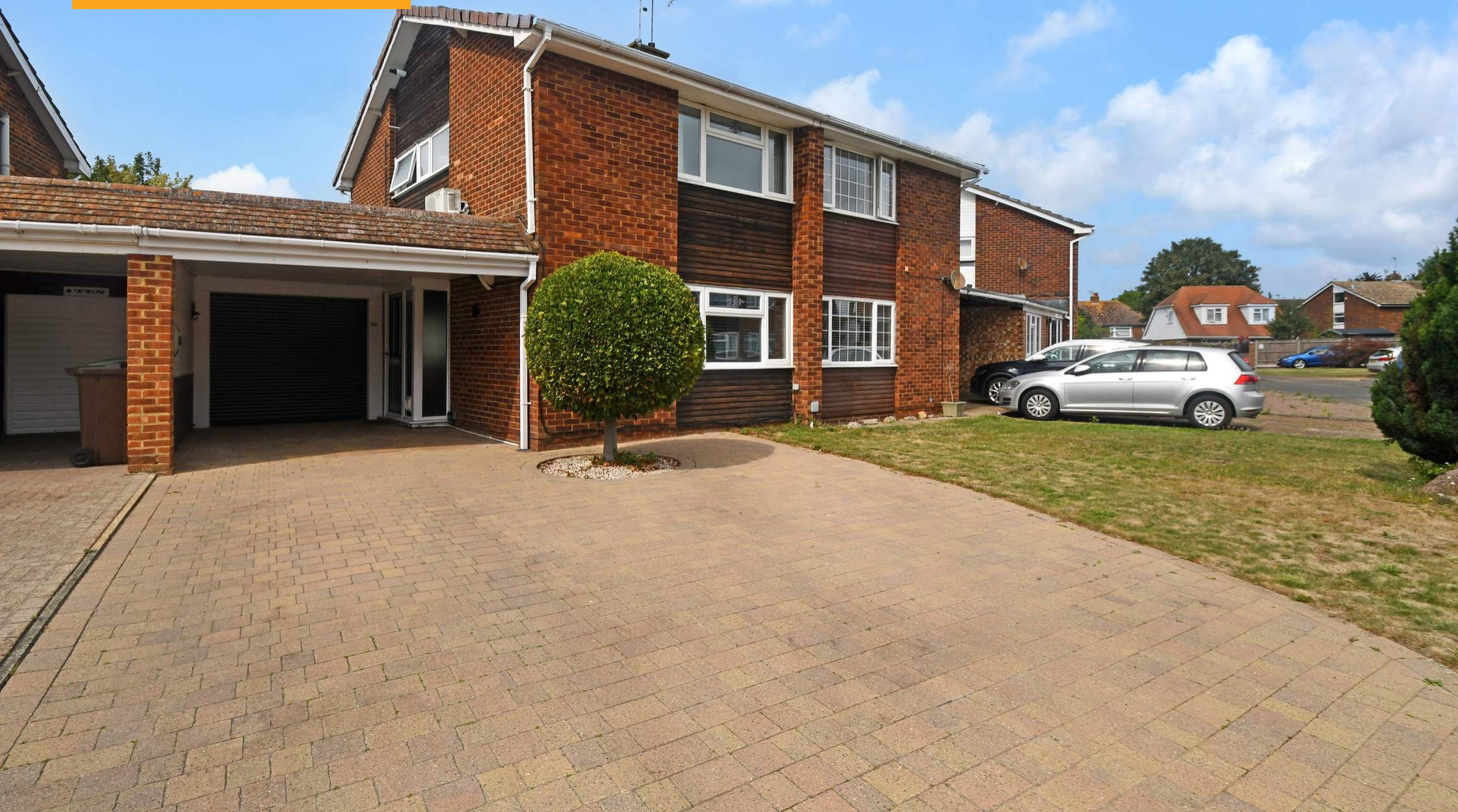
Three Bedroom Semi-Detached House Crosier Court, Upchurch, Sittingbourne,, Kent, ME9 7AR