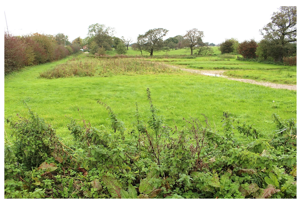
Broughton M6 Motorway – 3 miles