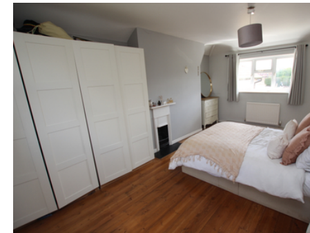
73 Cambridge Road, Langford, Bedfordshire, SG18 9PS