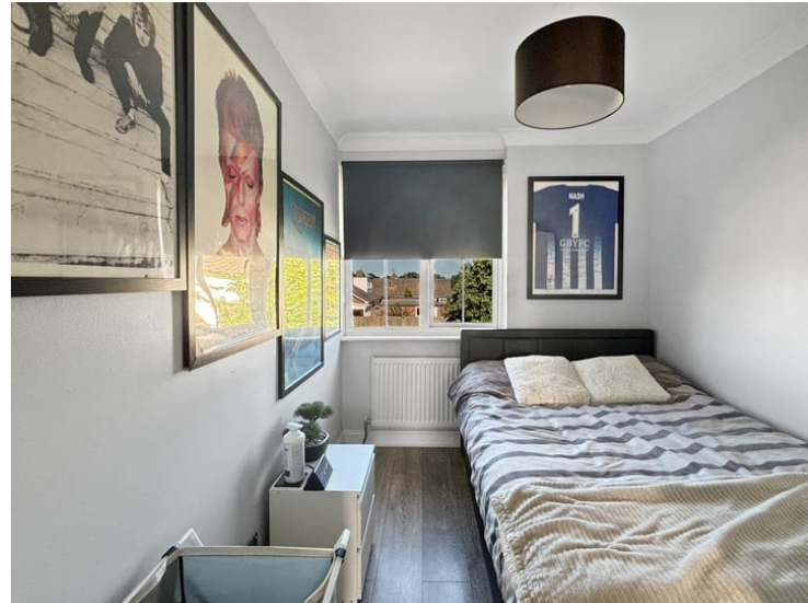
9' 09" x 7' 3" (2.97m x 2.21m) Double glazed window to front, radiator.