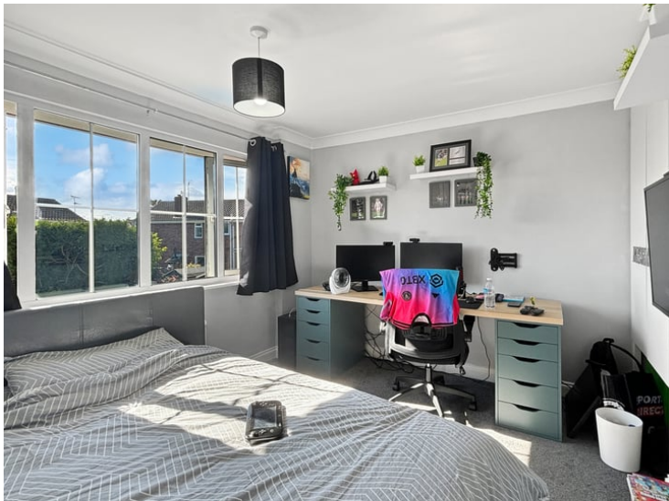
9' 08" x 9' 2" (2.95m x 2.79m) Double glazed windows to rear, radiator.