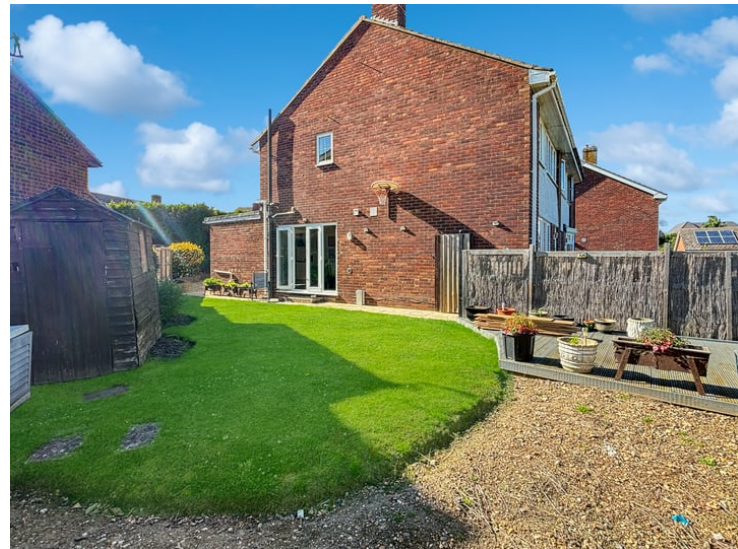
A well maintained south/west facing rear garden, mainly laid to lawn, retained by fencing, shed and side access to the front garden.