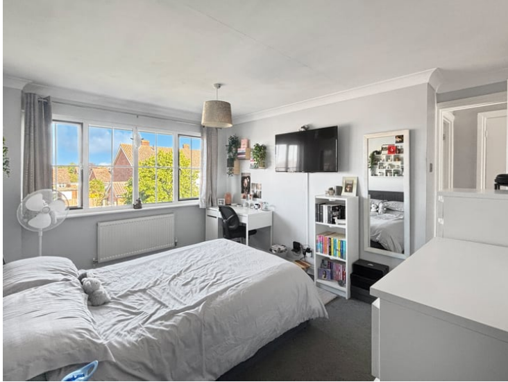
12' 11" x 10' 0" (3.94m x 3.05m) Double glazed window to front, radiator.