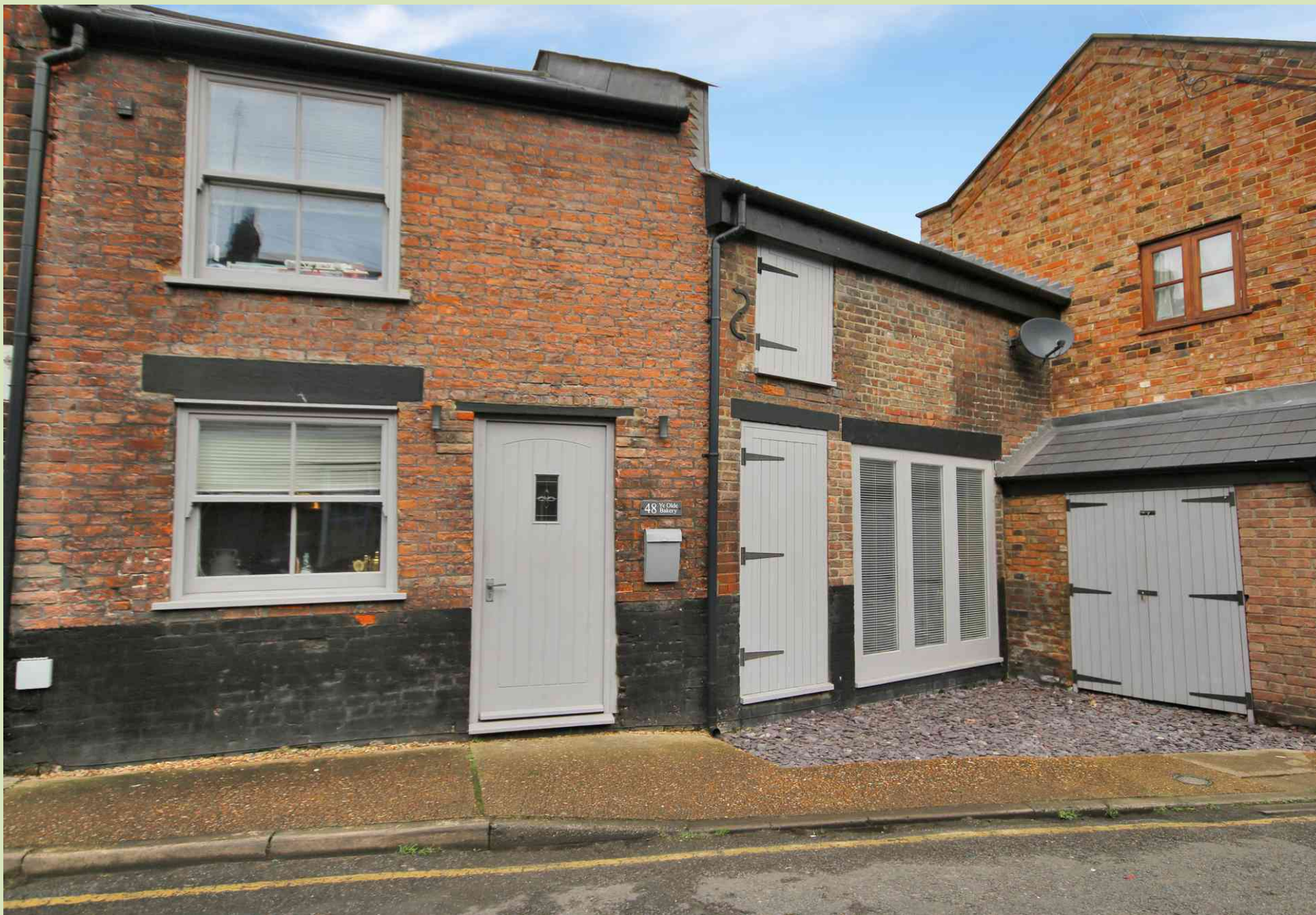
48 Guanock Terrace, King's Lynn Guide Price £185,000