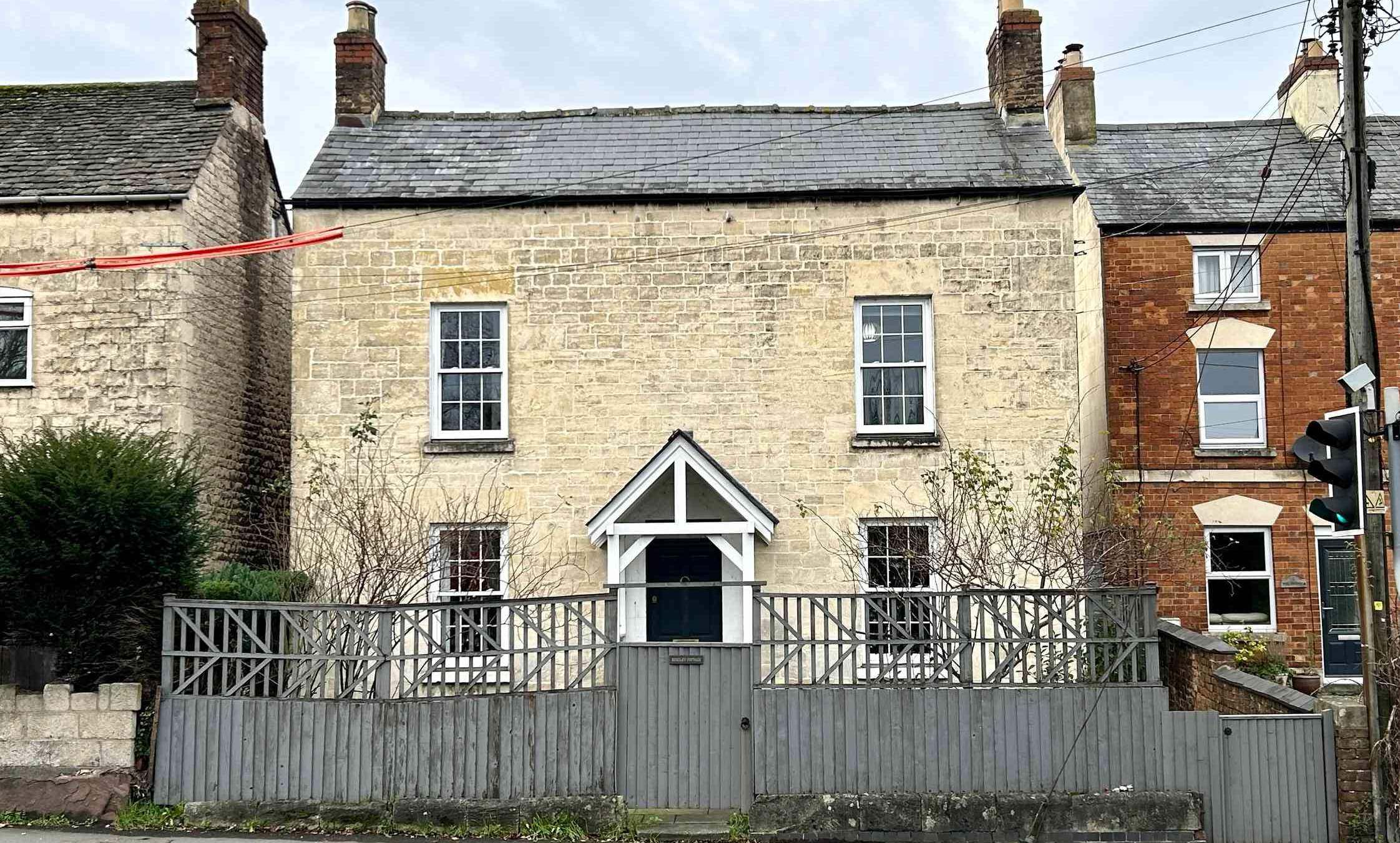
Kingley Cottage Paganhill Lane, Stroud, Gloucestershire, GL5 4JH Guide Price £625,000