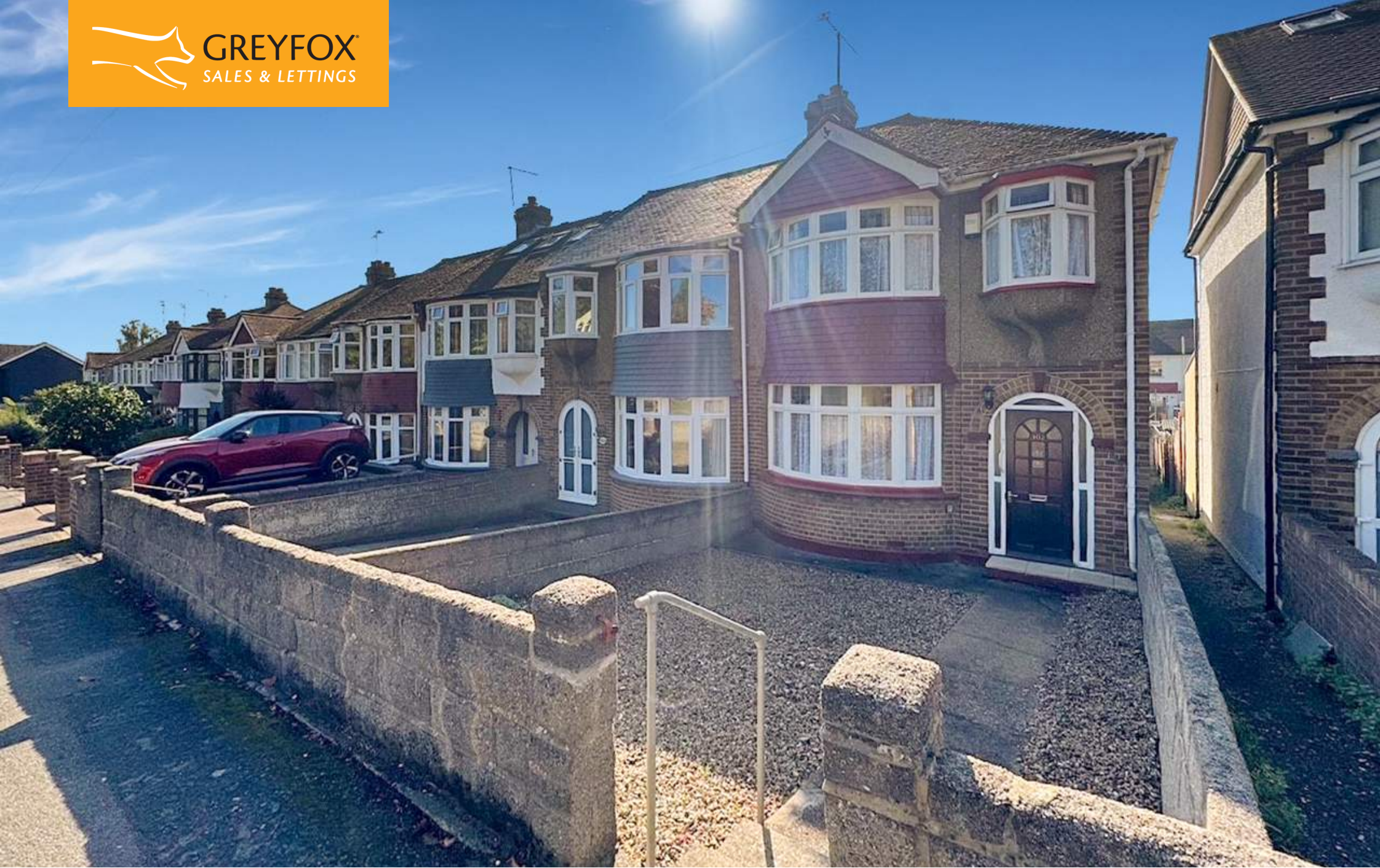
Three Bedroom Terraced House Grange Road, Gillingham, Kent, ME7 2QS