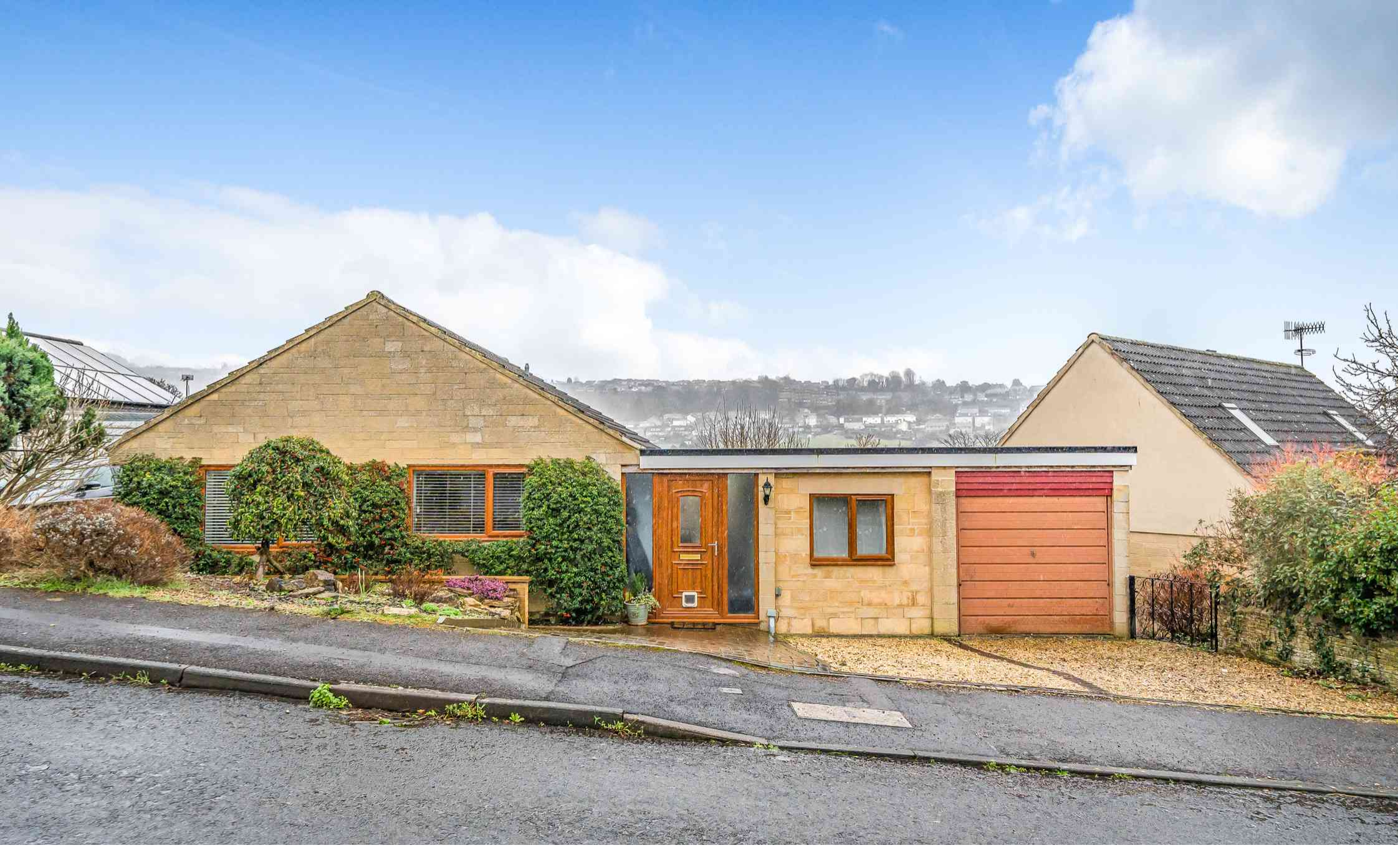
16 Shepherds Croft, Uplands, Stroud, Gloucestershire, GL5 1US Guide Price £400,000