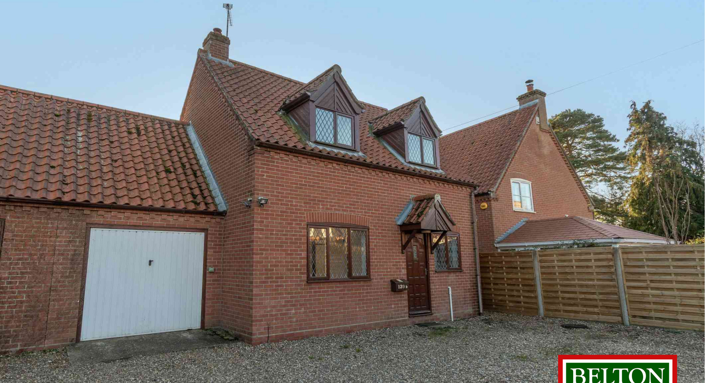
120b The Street, Kettlestone Guide Price £400,000