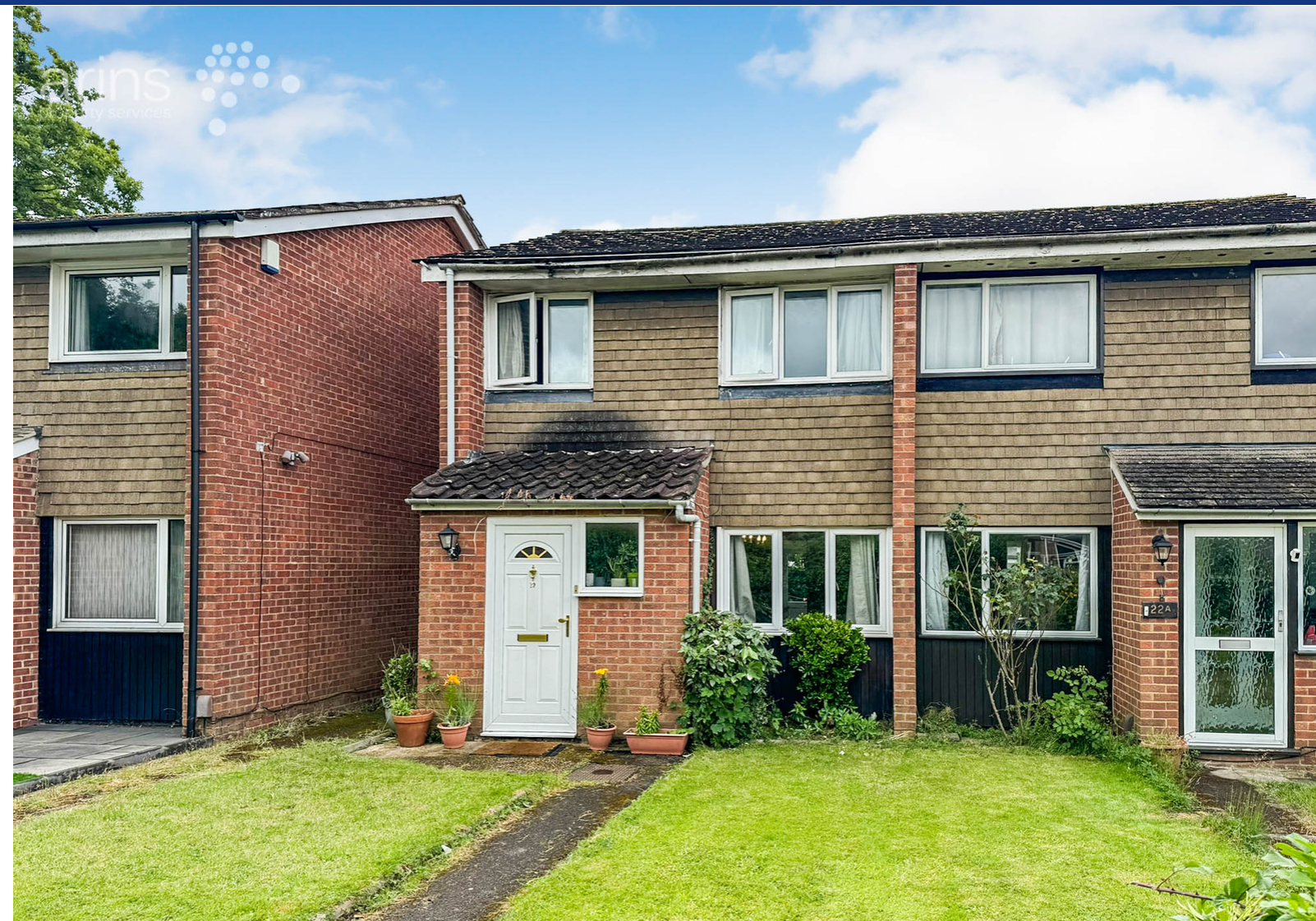
22 Devitt Close, Reading, Berkshire. RG2 8EF.