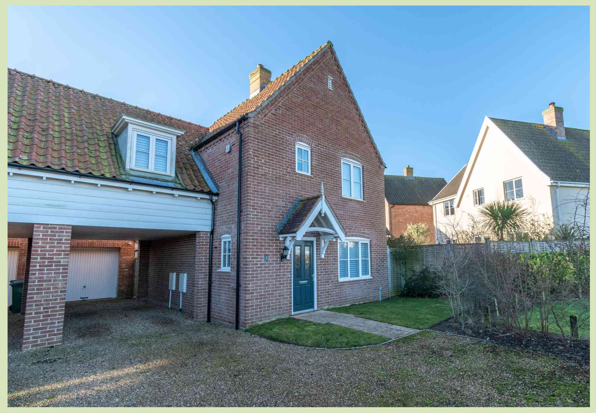
2 Market Lane, Wells-next-the-Sea Guide Price £499,950