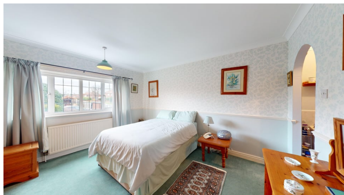
Master Bedroom With Shower