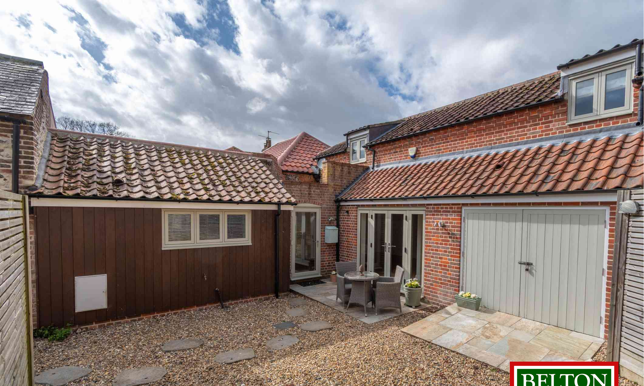
Stable Cottage, Harpley Guide Price £295,000