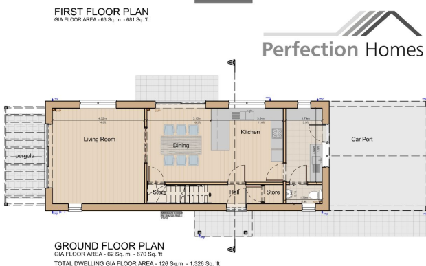
GROUND FLOOR PLAN GIA FLOOR AREA - 62 Sq. m - 670 Sq. ft TOTAL DWELLING GIA FLOOR AREA - 126 Sq. m - 1,326 Sq. ft