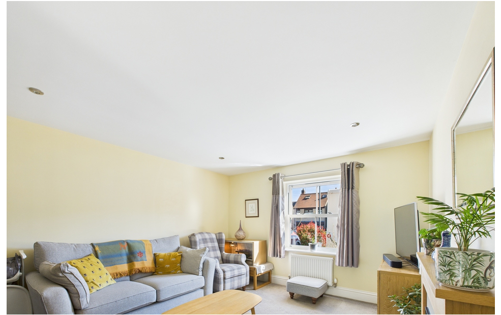
Spencer Road, Belper, Derbyshire DE56 1JY £500,000 - Freehold