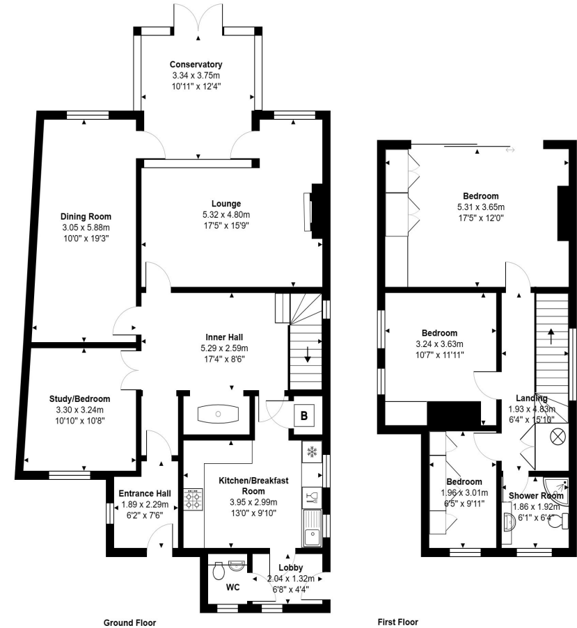
111, Thames Side, Staines-upon-thames, TW18 2HQ