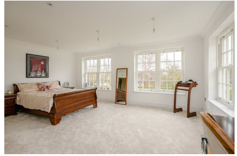
5.64m x 5.61m (18' 6" x 18' 5") Draws light from the sash windows from two elevations. Coved cornice to ceiling. Door to:-