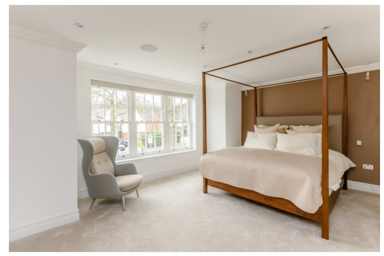
6.40m x 5.05m (21' 0" x 16' 7") Sash windows to front and rear elevations.