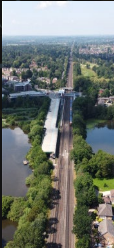
Rail Line/Fleet Pond