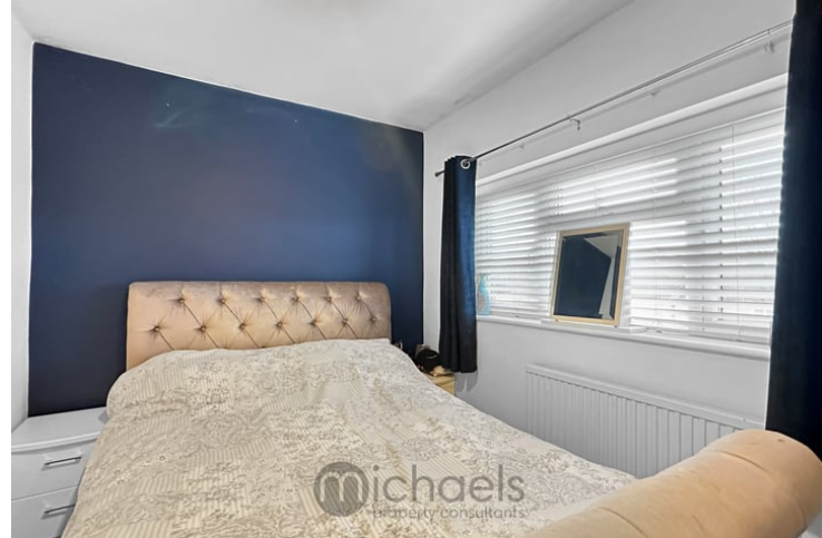
10' 0" x 7' 5" (3.05m x 2.26m) Window to rear aspect, radiator, inset storage cupboard