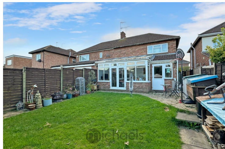
Outside, the property is further enhanced by a spacious garden, predominantly laid to lawn and complimented with a patio. Boundaries are formed by panel fencing. There is also a small front garden on offer.