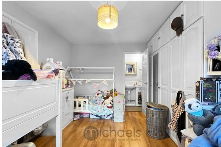
15' 0" x 10' 6" (4.57m x 3.20m) Window to front aspect, airing cupboard, radiator, built in wardrobe, access to en-suite cloakroom