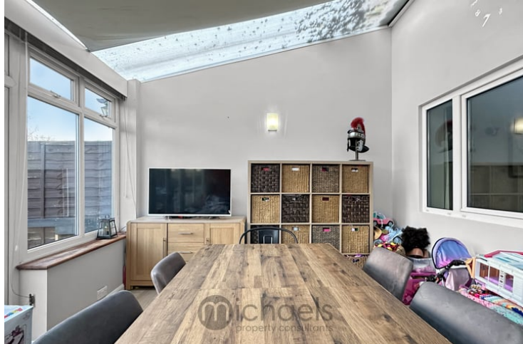
15' 0" x 10' 10" (4.57m x 3.30m) Windows to all aspect, door to rear aspect (providing access to rear garden), radiator