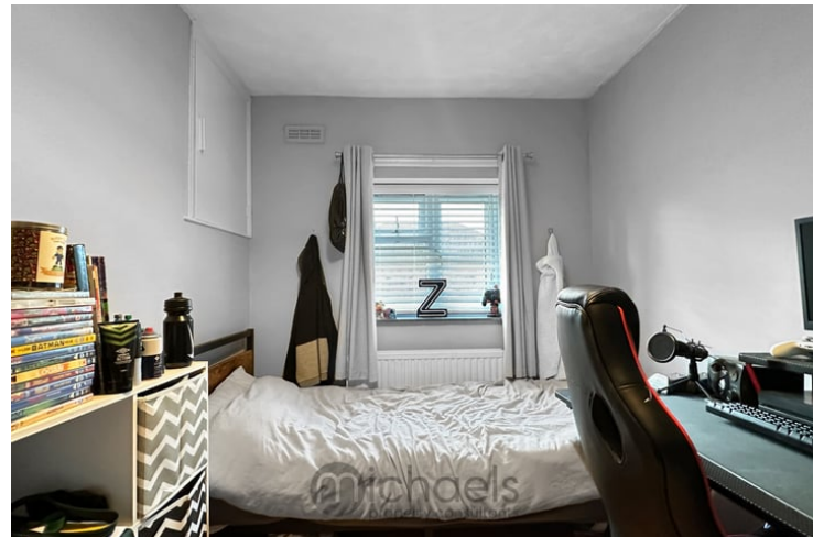
9' 9" x 7' 1" (2.97m x 2.16m) 9' 9" x 7' 1" (2.97m x 2.16m) Window to front aspect, radiator