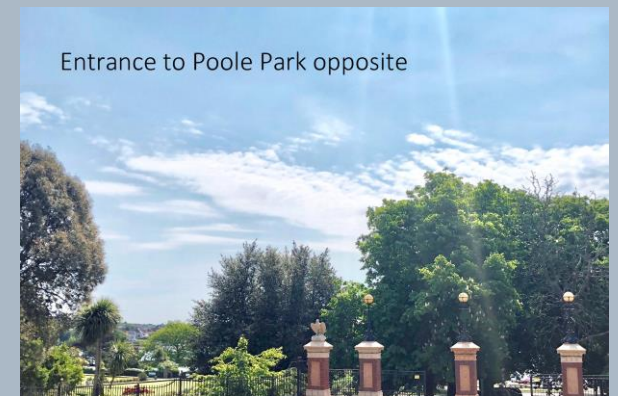
Entrance to Poole Park opposite