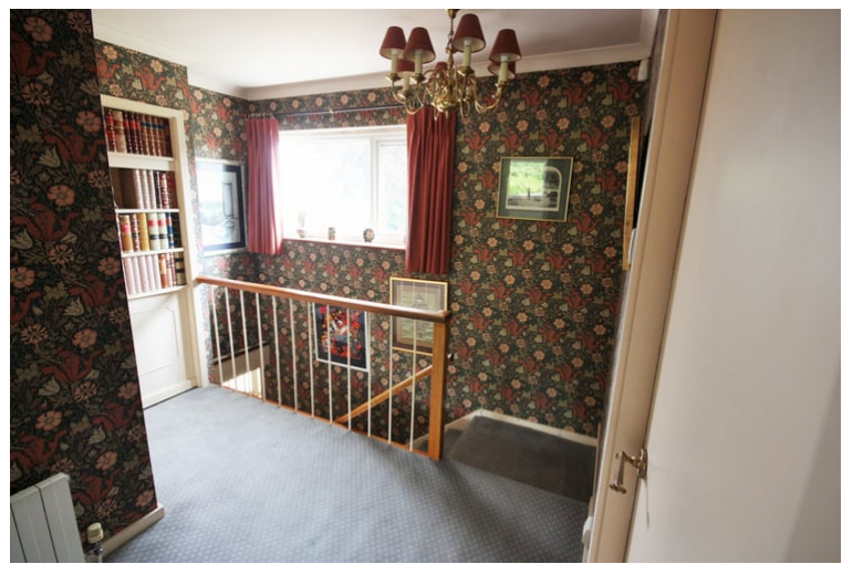
3.3m x 3.2m (10' 10" x 10' 6") Large window to front aspect and doors leading to accommodation.