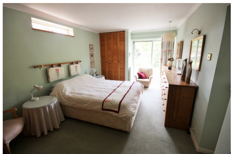
5.1m x 3.3m (16' 9" x 10' 10") Large room with built in wardrobes and en suite. Door leading to the sun terrace and overlooking the mature rear garden.