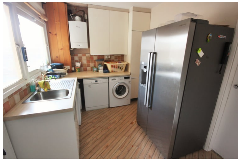
3.2m x 2.3m (10' 6" x 7' 7") Range of wall and base level units with built in sink drainer unit and wall mounted boiler. Door leading to side access and window to front aspect.