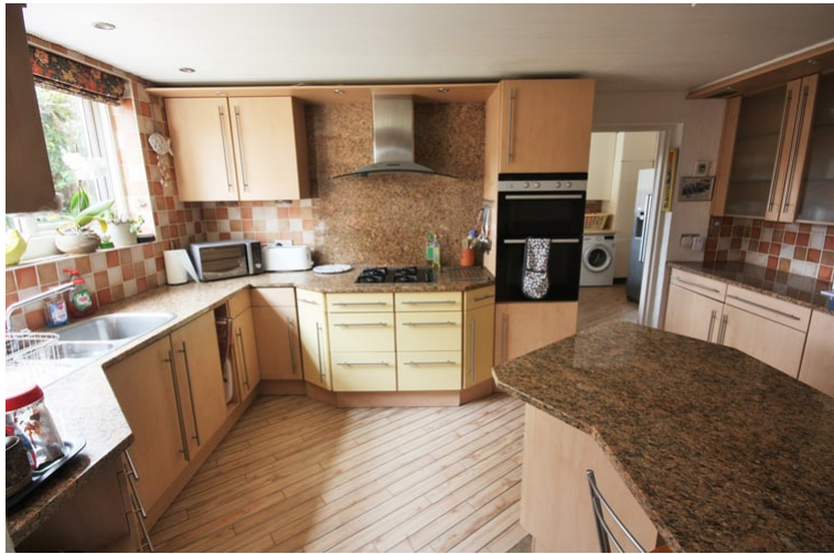
4.8m x 4.4m (15' 9" x 14' 5") max. Large window to front aspect surrounded by a comprehensive range of wall and base level units with work surfaces incorporating sink drainer unit, gas hob and double oven. There is also matching breakfast bar and display area. Also you will find three large cupboards for storage.