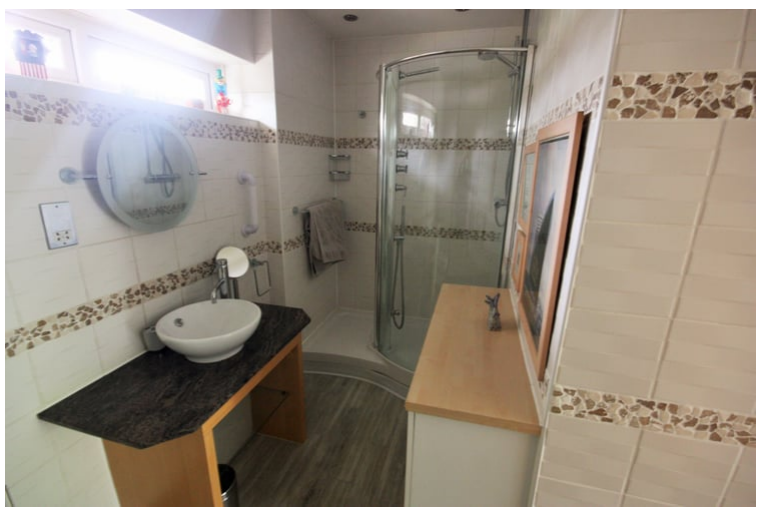
3.2m x 2m (10' 6" x 6' 7") Large walk in shower cubicle, low level w/c and wash basin. Small window to front.