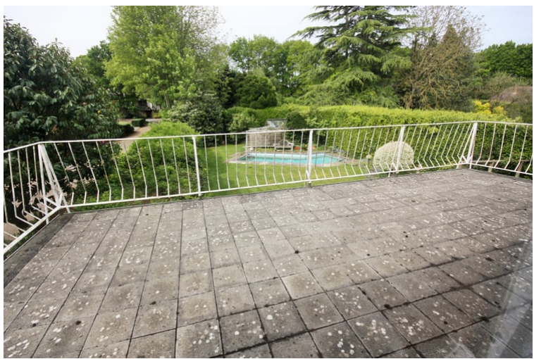
Accessed directly from the master bedroom and retained by railings. This offers excellent views of the mature rear garden and acts as a sun trap in this South westerly facing garden.