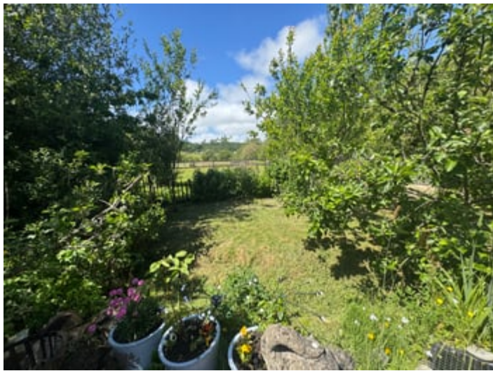
GARDEN (THIRD IMAGE)