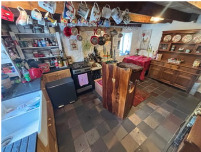
KITCHEN (SECOND IMAGE)