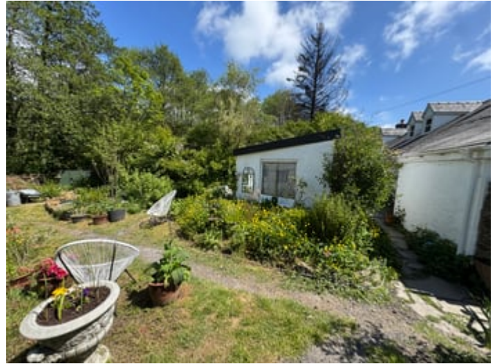
GARDEN (FIFTH IMAGE)