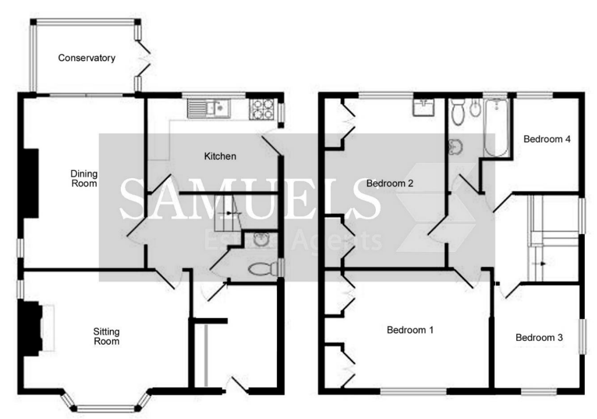
Floor plan for illustration purposes only - not to scale