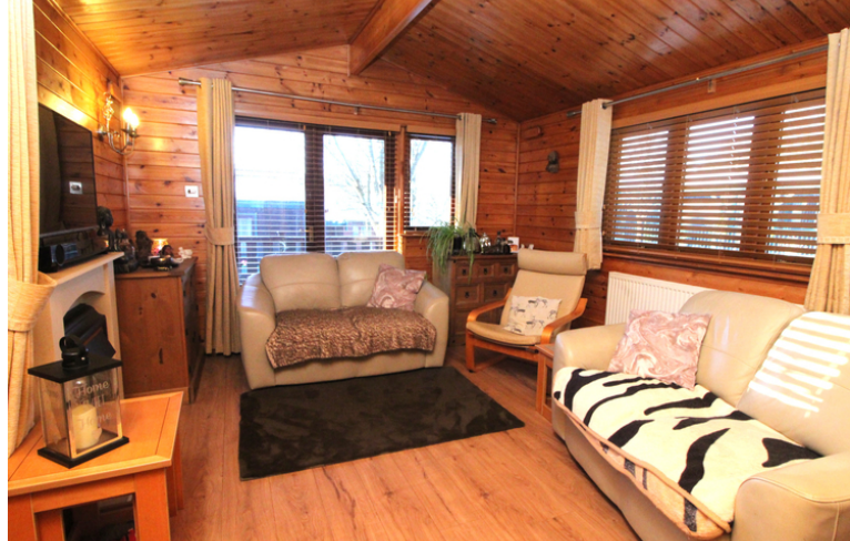
11 Moor Valley Park, Mill Lane, Hawksworth, Leeds, West Yorkshire, LS20 8PQ