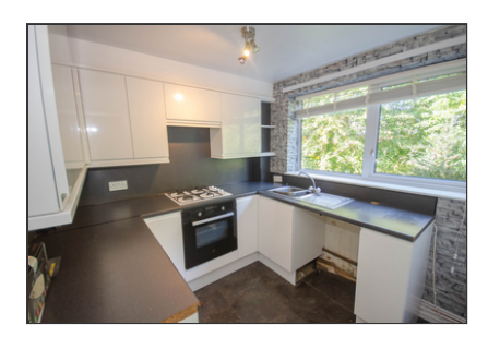
Brown & Cockerill Estate Agents 12 Regent Street Rugby Warwickshire CV21 2QF