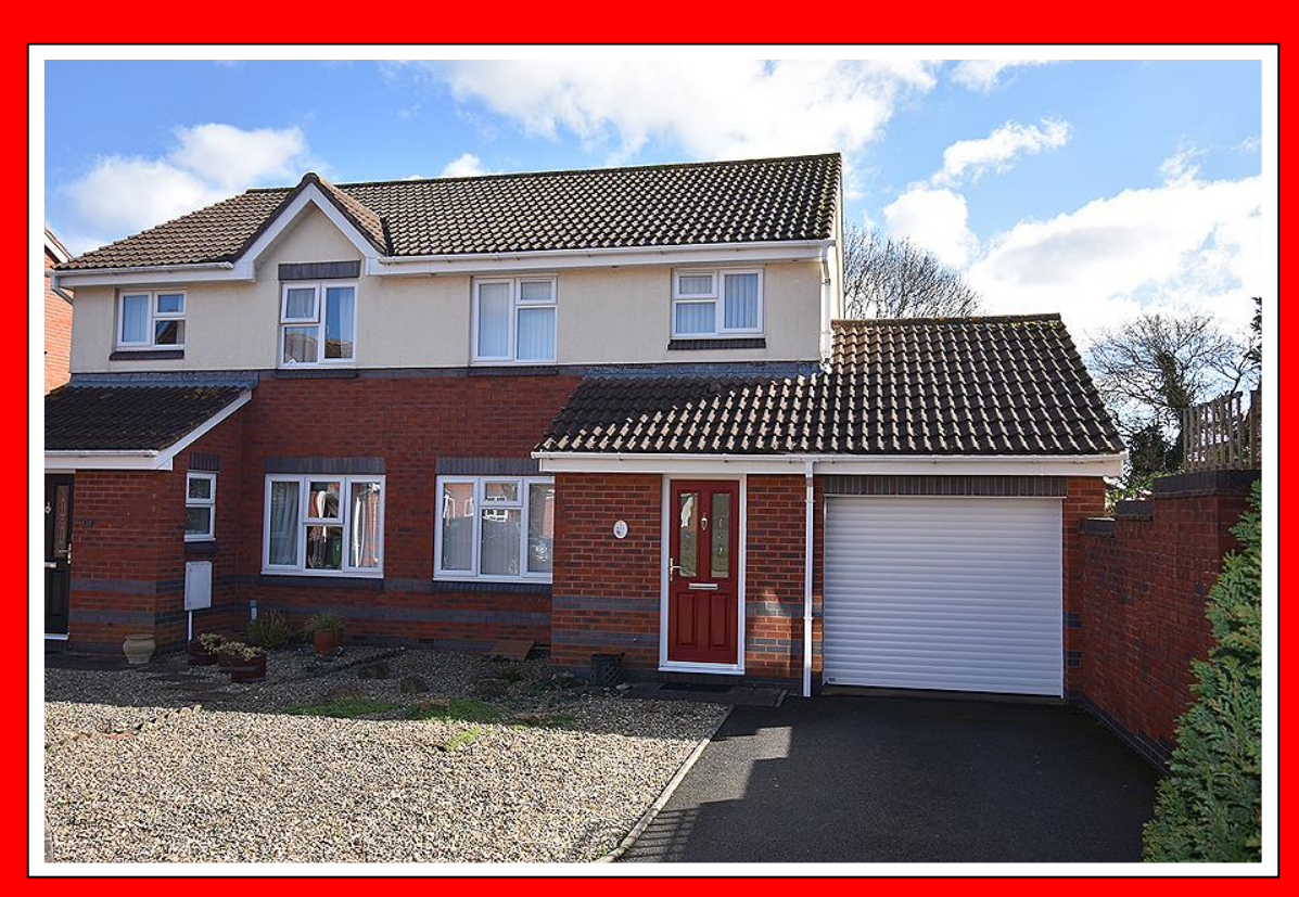
GUIDE PRICE £350,000-£360,000 FREEHOLD