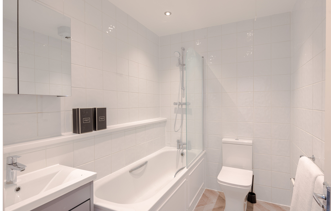
Ground Floor 55 York Street, Marylebone, London, W1H 1PU £650 p/w