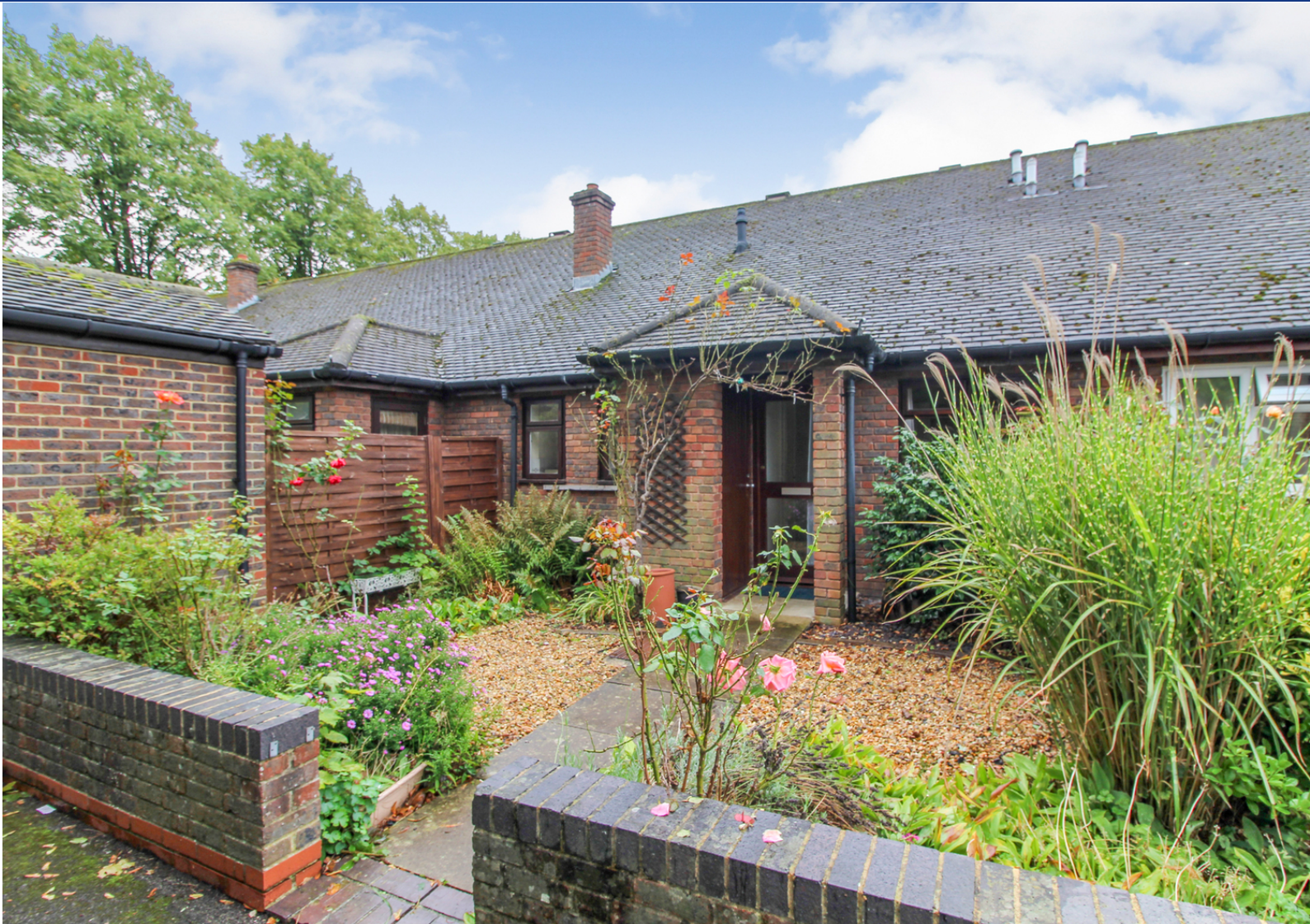
Brock Gardens, Reading, Berkshire.