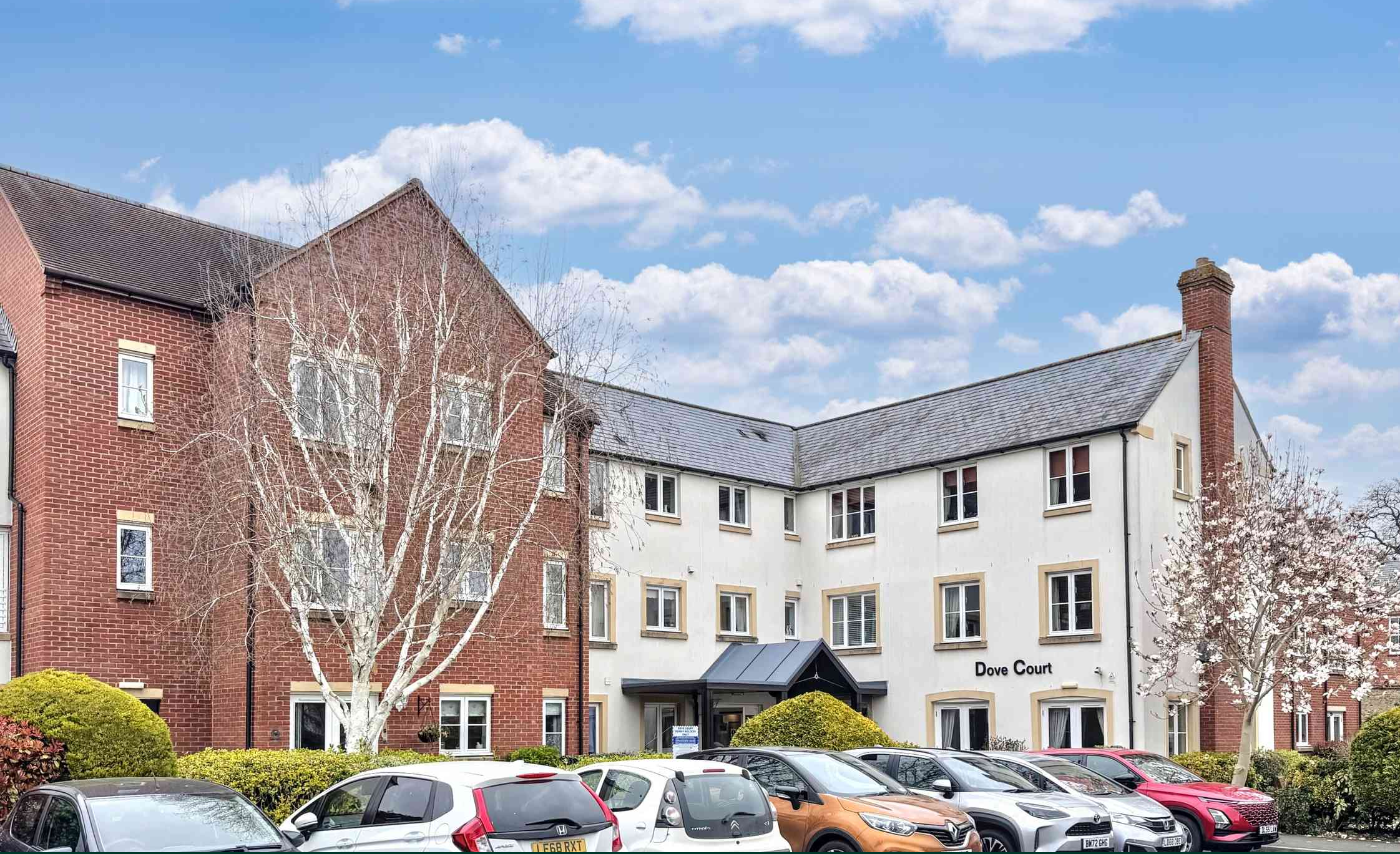
Dove Court, Swan Lane, Faringdon Oxfordshire, Guide Price £105,000