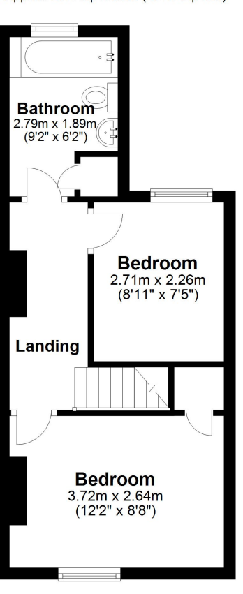
Total area: approx. 56.9 sq. metres (612.5 sq. feet)

Approx. 27.4 sq. metres (294.7 sq. feet)