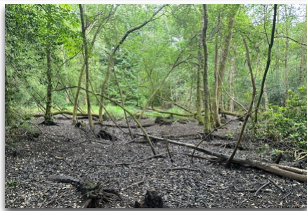
The Nest Nursery, The Long Road, Rowledge, Farnham, Surrey. GU10 4EB.