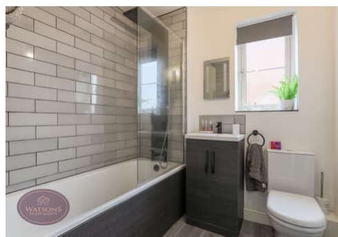
• Modern 3 Storey Semi Detached House