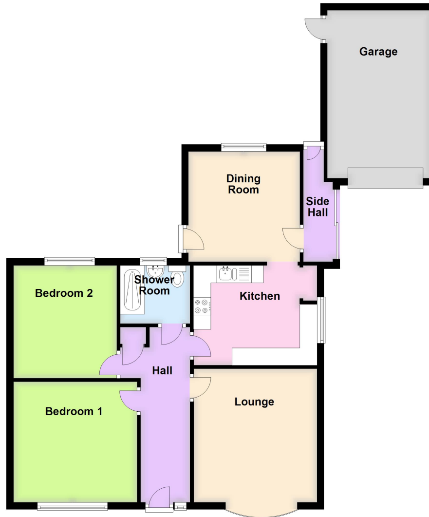
Total area: approx. 87.5 sq. metres (941.8 sq. feet)