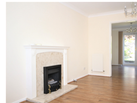
23 Webb Close, Letchworth Garden City, Hertfordshire, SG6 2TY