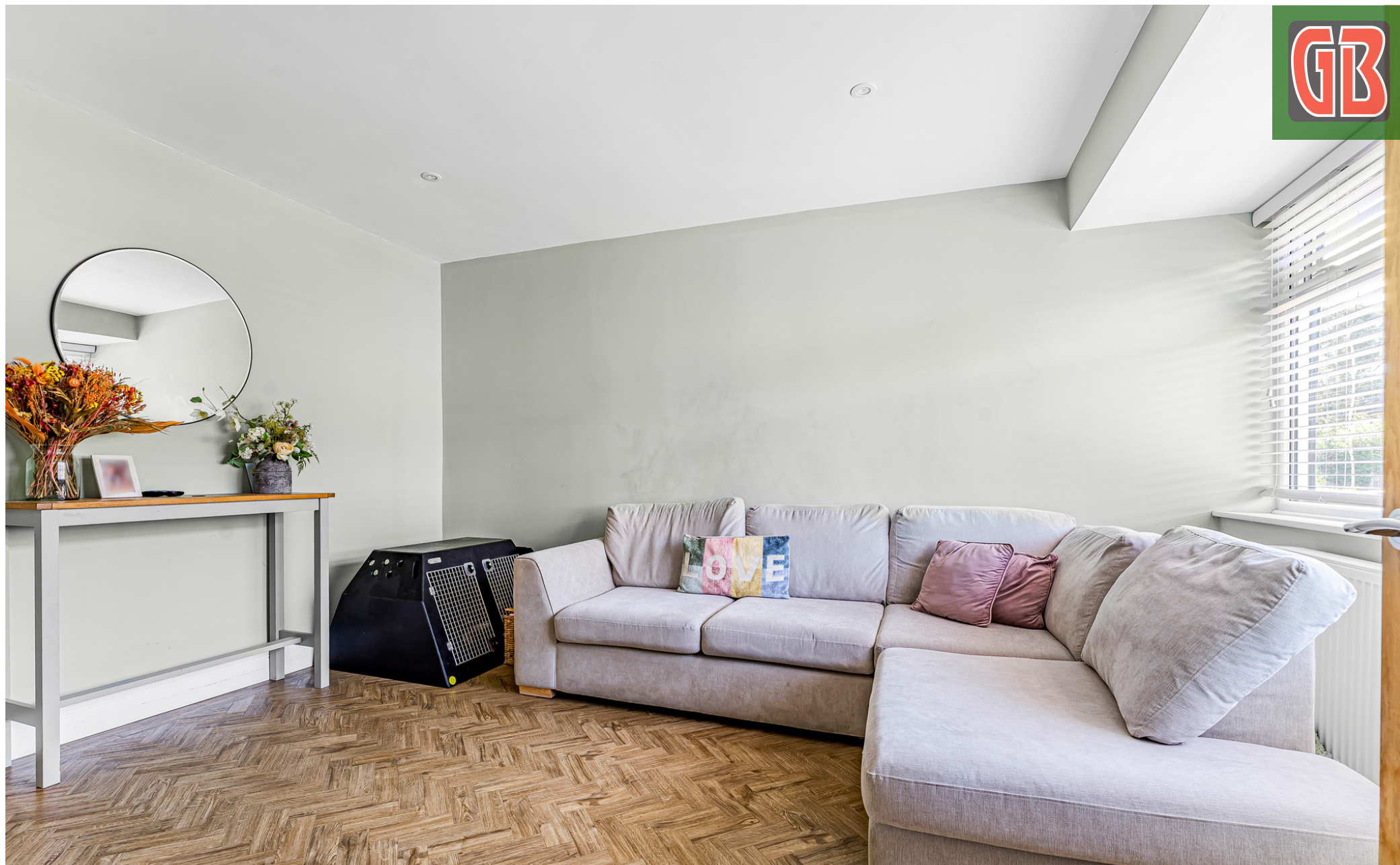
27 Kenilworth Gardens, Staines-upon-Thames, Surrey. TW18 1DW. 2 Bedroom Terraced House - £430,000 Freehold