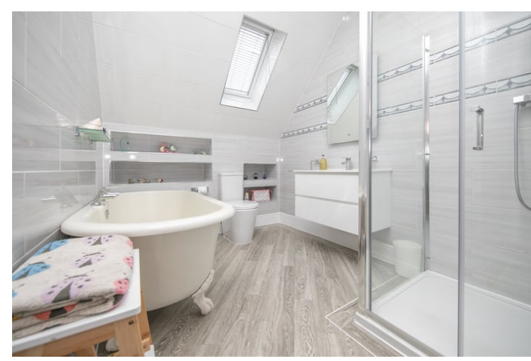
Velux window to side, tiled walls, radiator, free standing bath, low level WC, shower encloser. Loft access ( part boarded and insulated)