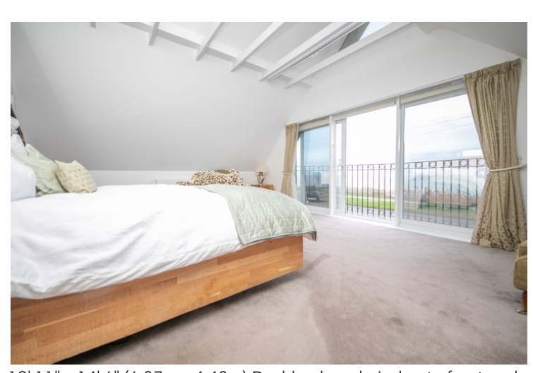
19'\,11''\,x\,14'\,6'' (6.07m x 4.42m) Double glazed window to front and patio door opening onto the balcony, vaulted celling, two radiators, wall lights, projector with drop down screen and surround system, doors to: