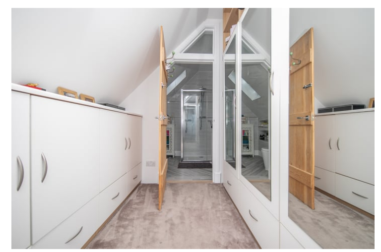
Velux window to side, fitted wardrobes and storage draws/cupboards.