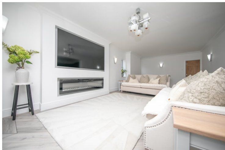
26' 02" x 13' 09" (7.98m x 4.19m) Double glazed windows to side and rear, French doors to rear opening onto the garden, two radiators, built in media wall, open living space.