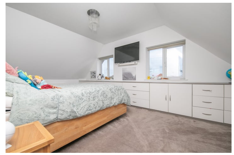
19' 11" x 11' 0" (6.07m x 3.35m) 23' 0" x 5' 6" (7.01m x 1.68m) L Shape turning to: Double glazed window to rear and Velux windows to side, fitted wardrobes and storage draws, airing cupboard.