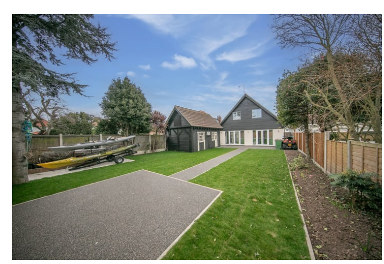
A beautifully maintained rear garden mainly laid to lawn, resin footpaths with raised patio area and hard standing area ready for garden shed, retained by privacy fencing, side access via both sides of the property.