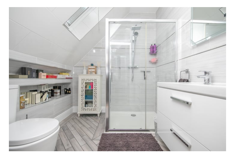
Velux window to side, towel rail, celling extractor fan, tiled walls, low level WC, vanity unit, shower enclosure.