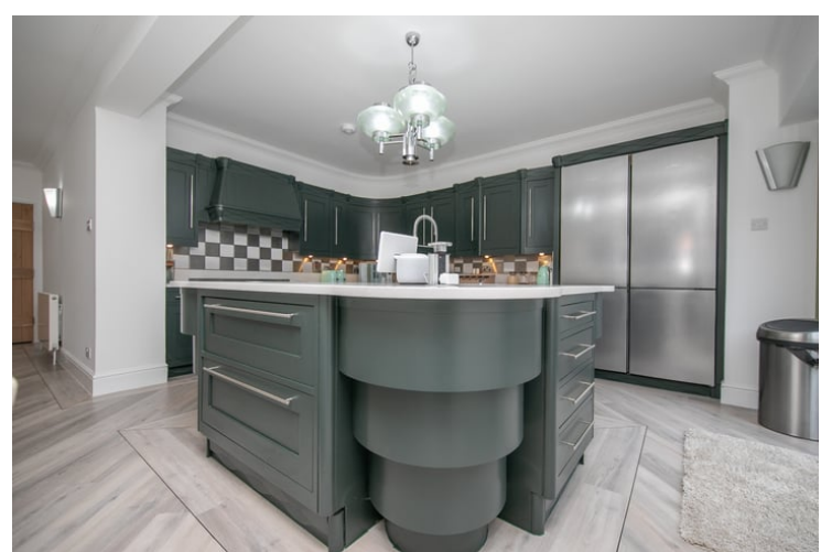
15'11" x 12'2" (4.85m x 3.71m) Double glazed window and French doors to rear, wall lights, a beautiful Italian kitchen including a range of wall and base units, kitchen island, marble worktop, tiled splash back, inset double sink with left and right drainer groves, American style fridge/freezer, range style cooker with gas hob, over head cooker hod, combination oven and microwave, dish washer.