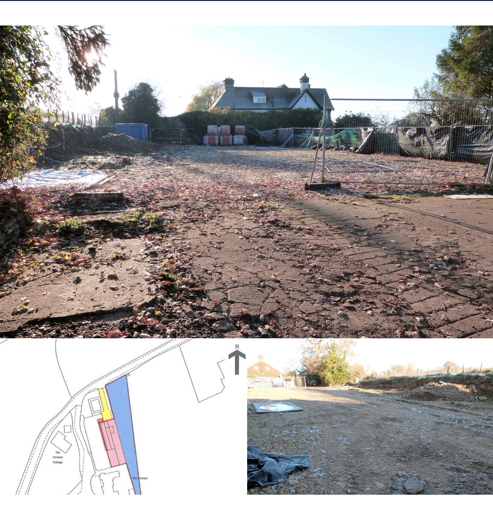
Old Orchard Lodge Cottage

Park Lane, Harefield, Middlesex, UB9 6HJ