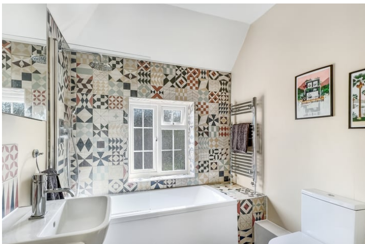
6' 8" x 6' 11" (2.03m x 2.11m) With window to rear aspect, panelled bath with shower over, wash hand vanity basin, WC.