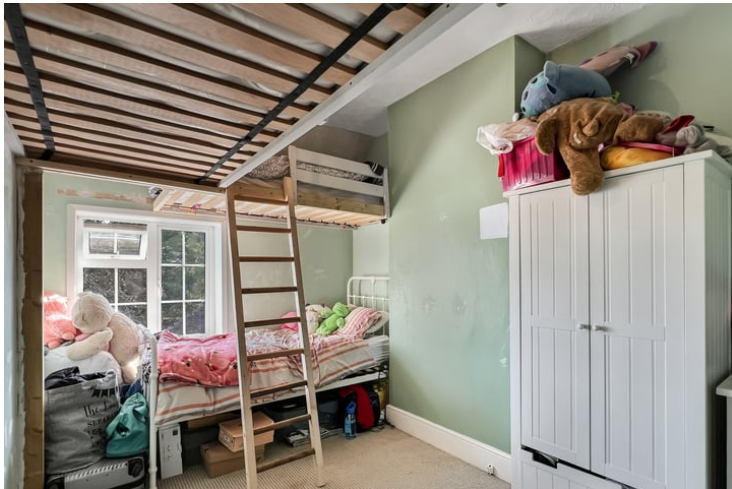
13' 0" x 8' 9" (3.96m x 2.67m) With window to rear aspect, radiator.