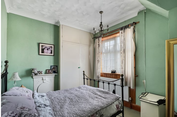
11' 10" x 9' 3" (3.61m x 2.82m) With window to front aspect, radiator, built in double wardrobe, built in cupboard.