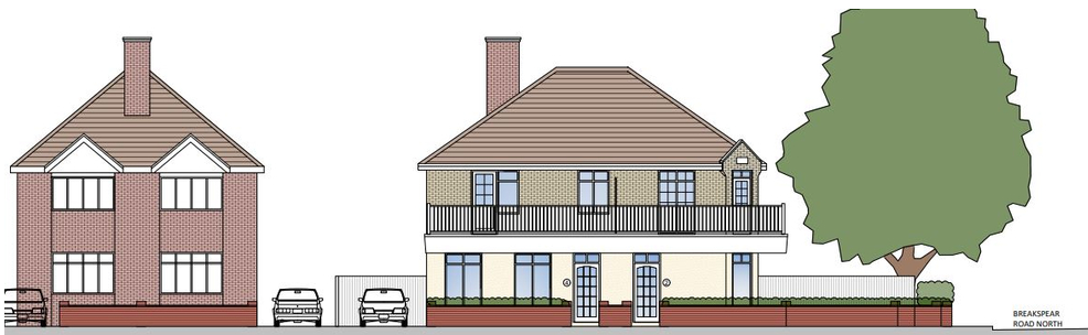
STREET ELEVATION (NORTHWOOD ROAD)