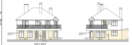
NORTH WEST ELEVATION (TO NORTHWOOD ROAD) SOUTH WEST ELEVATION (TO BREAKSPEAR ROAD NORTH)