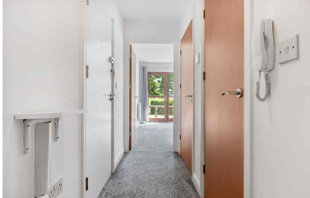
7 Vaughan House, John North Close, High Wycombe, Buckinghamshire HP11 1FF Guide Price £255,000 - Leasehold