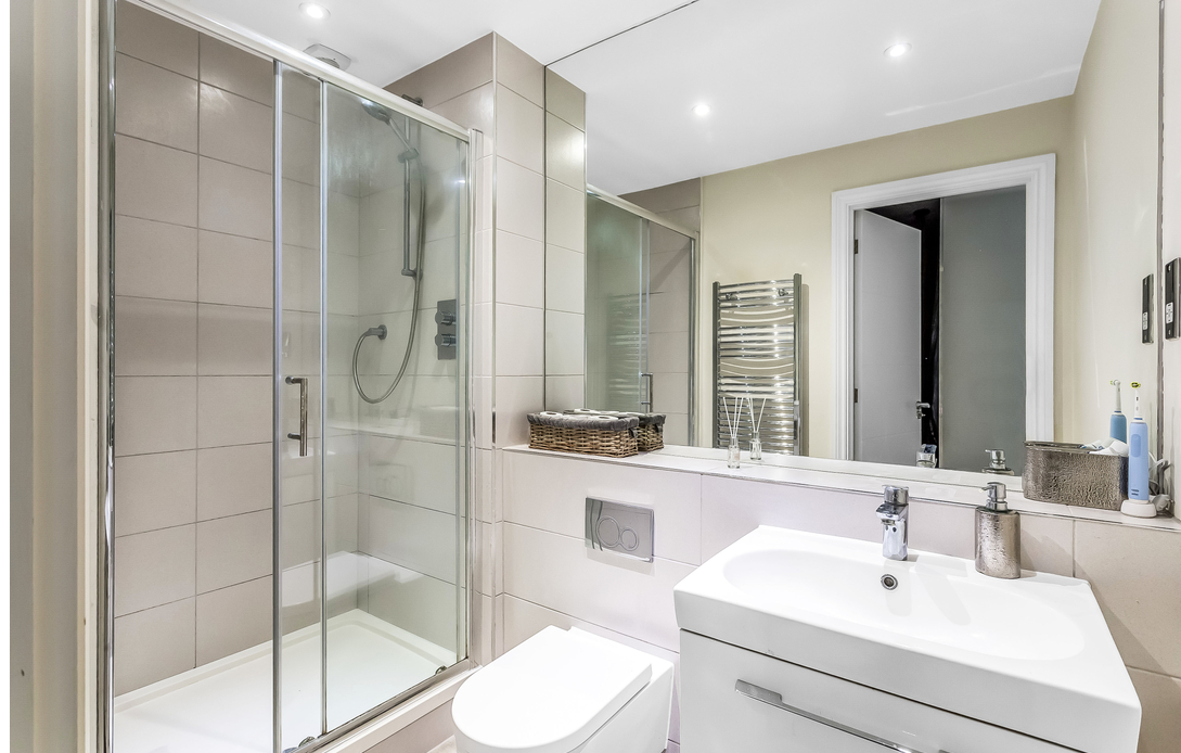
Flat 13, 2c Chaucer Court, Southlands Road, Bromley, Kent BR2 9HP £210,000 - Leasehold