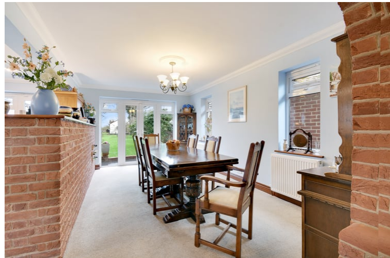
7.23m x 4.96m (23' 9" x 16' 3") Stretching the width of the

property, with truly stunning views over the extremely large rear garden, is this spacious kitchen dining room that is ideal for hosting friends and family.