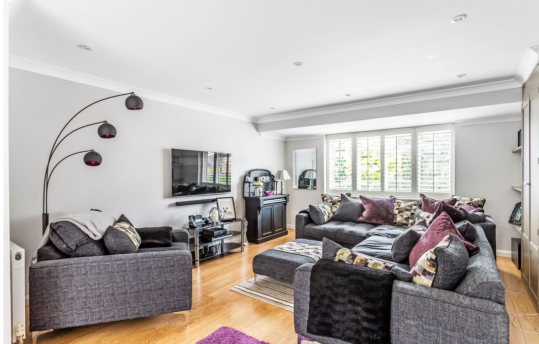
9 Mill Shaw, Oxted, Surrey RH8 9DQ £1,165,000 - Freehold